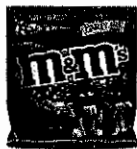
SNACK FOOD POUCHES