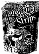
PET TREAT POUCHES