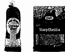
MEAT & CHEESE BAGS