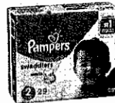
DIAPER WRAP PACKAGING (NO DIAPERS NEW OR USED)